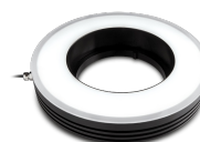
LTRN 064 NW Ring LED illuminator, white