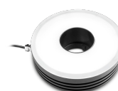
LTRN 016 NW Ring LED illuminator, white