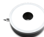
LTRN 023 NW Ring LED illuminator, white