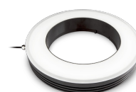
LTRN 096 NW Ring LED illuminator, white