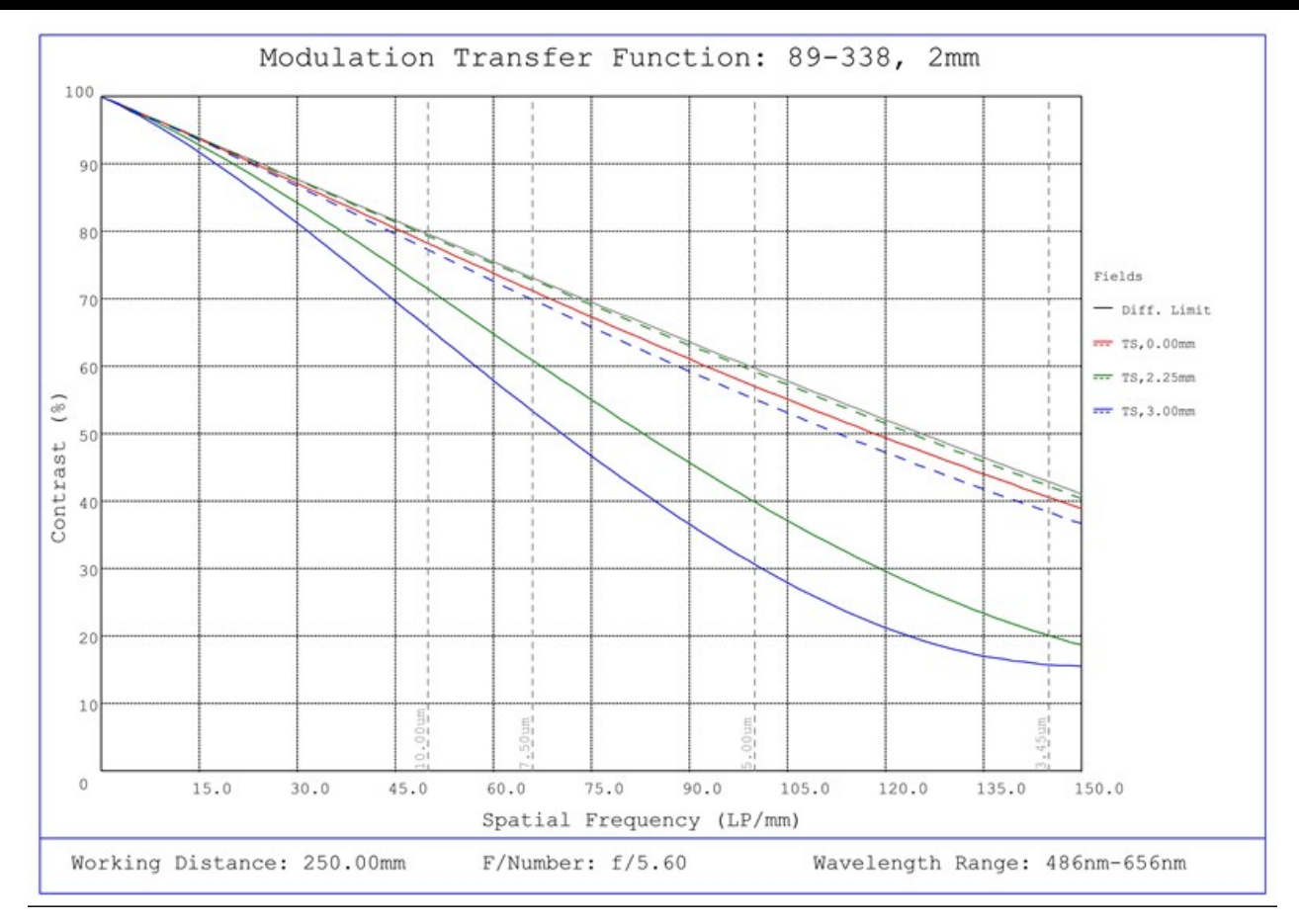
#89-338, 2mm FL f/5.6, Blue Series M12 Lens, Modulated Transfer Function (MTF) Plot, 250mm Working Distance, f5.6