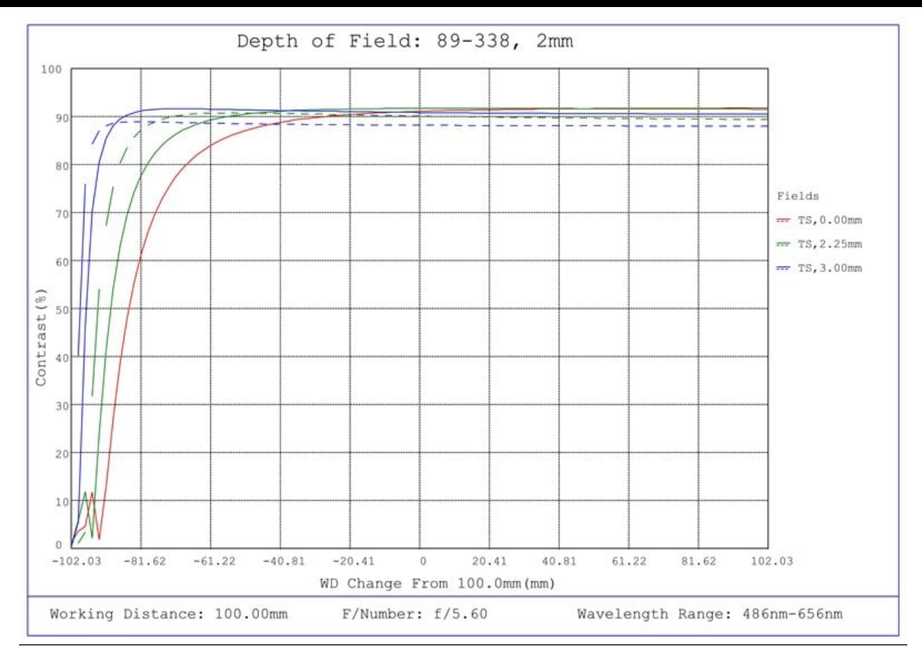
#89-338, 2mm FL f/5.6, Blue Series M12 Lens, Depth of Field Plot, 100mm Working Distance, f5.6