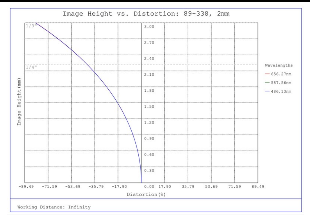
#89-338, 2mm FL f/5.6, Blue Series M12 Lens, Distortion Plot