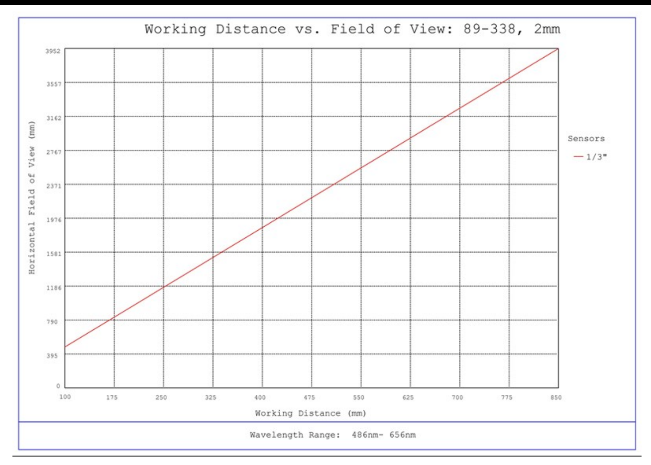
#89-338, 2mm FL f/5.6, Blue Series M12 Lens, Working Distance versus Field of View Plot