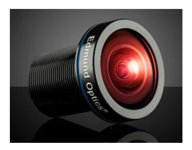
2mm FL Blue Series M12 Imaging Lens

TECHSPEC® Blue Series M12 Lenses feature high resolution performance, along with the same great versatility of our <u>TECHSPEC® Green Series M12 Lenses</u>. Each lens consists of several precision glass elements mounted in a compact, aluminum housing. These lenses can connect to C-Mount cameras using the M12 x 0.5 Adapter for C-Mount Cameras (#53-675) or the M12 x 0.5 C-Mount Adapter with Rubber O-Ring (#59-241) for vibration-sensitive environments. TECHSPEC® Blue Series M12 Lenses are ideal for automotive, industrial, and medical imaging application. Prescription data is available by submitting a Request for Prescription Form.