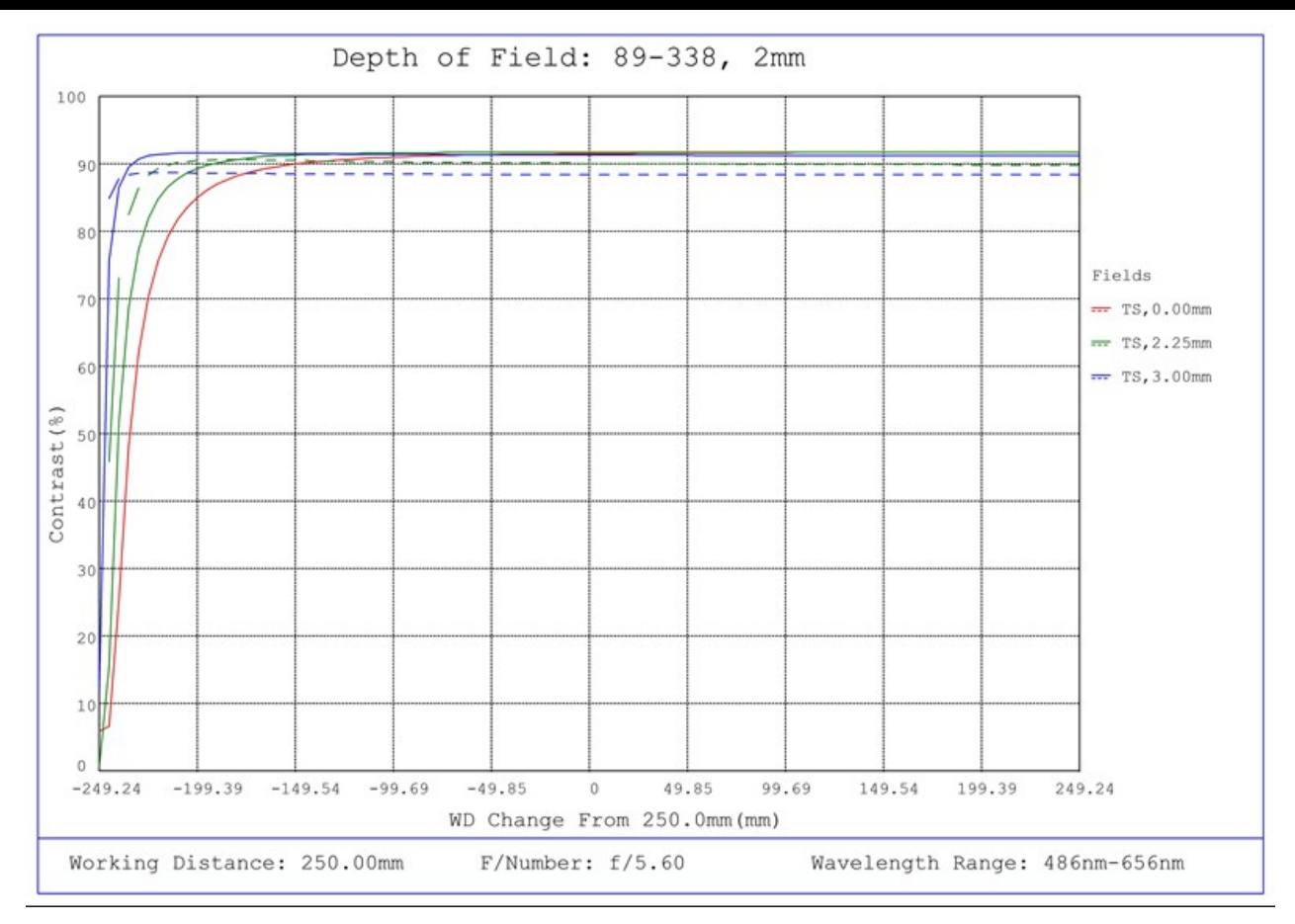
#89-338, 2mm FL f/5.6, Blue Series M12 Lens, Depth of Field Plot, 250mm Working Distance, f5.6