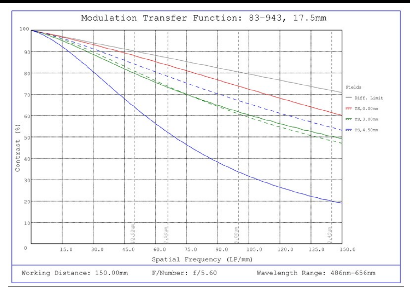
#83-943, 17.5mm FL f/5.6, Blue Series M12 Lens, Modulated Transfer Function (MTF) Plot, 150mm Working Distance, f5.6