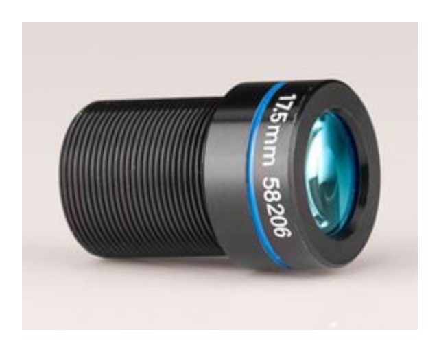
17.5mm FL Blue Series M12 Lens

TECHSPEC® Blue Series M12 Lenses feature high resolution performance, along with the same great versatility of our <u>TECHSPEC® Green Series M12 Lenses</u>. Each lens consists of several precision glass elements mounted in a compact, aluminum housing. These lenses can connect to C-Mount cameras using the M12 x 0.5 Adapter for C-Mount Cameras (#53-675) or the M12 x 0.5 C-Mount Adapter with Rubber O-Ring (#59-241) for vibration-sensitive environments. TECHSPEC® Blue Series M12 Lenses are ideal for automotive, industrial, and medical imaging application. Prescription data is available by submitting a Request for Prescription Form.