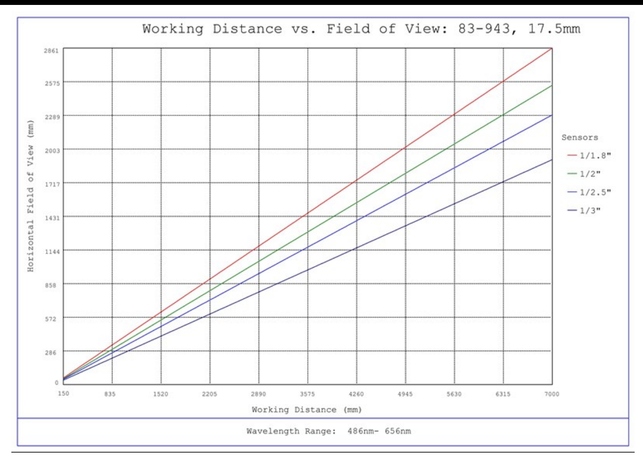
#83-943, 17.5mm FL f/5.6, Blue Series M12 Lens, Working Distance versus Field of View Plot