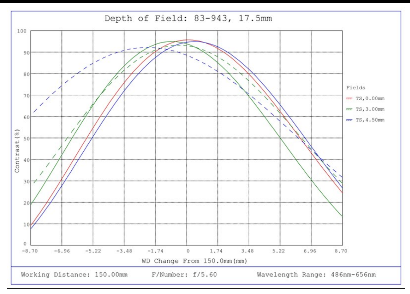
#83-943, 17.5mm FL f/5.6, Blue Series M12 Lens, Depth of Field Plot, 150mm Working Distance, f5.6