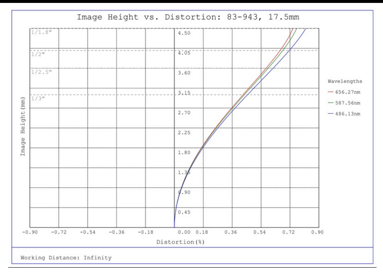
#83-943, 17.5mm FL f/5.6, Blue Series M12 Lens, Distortion Plot