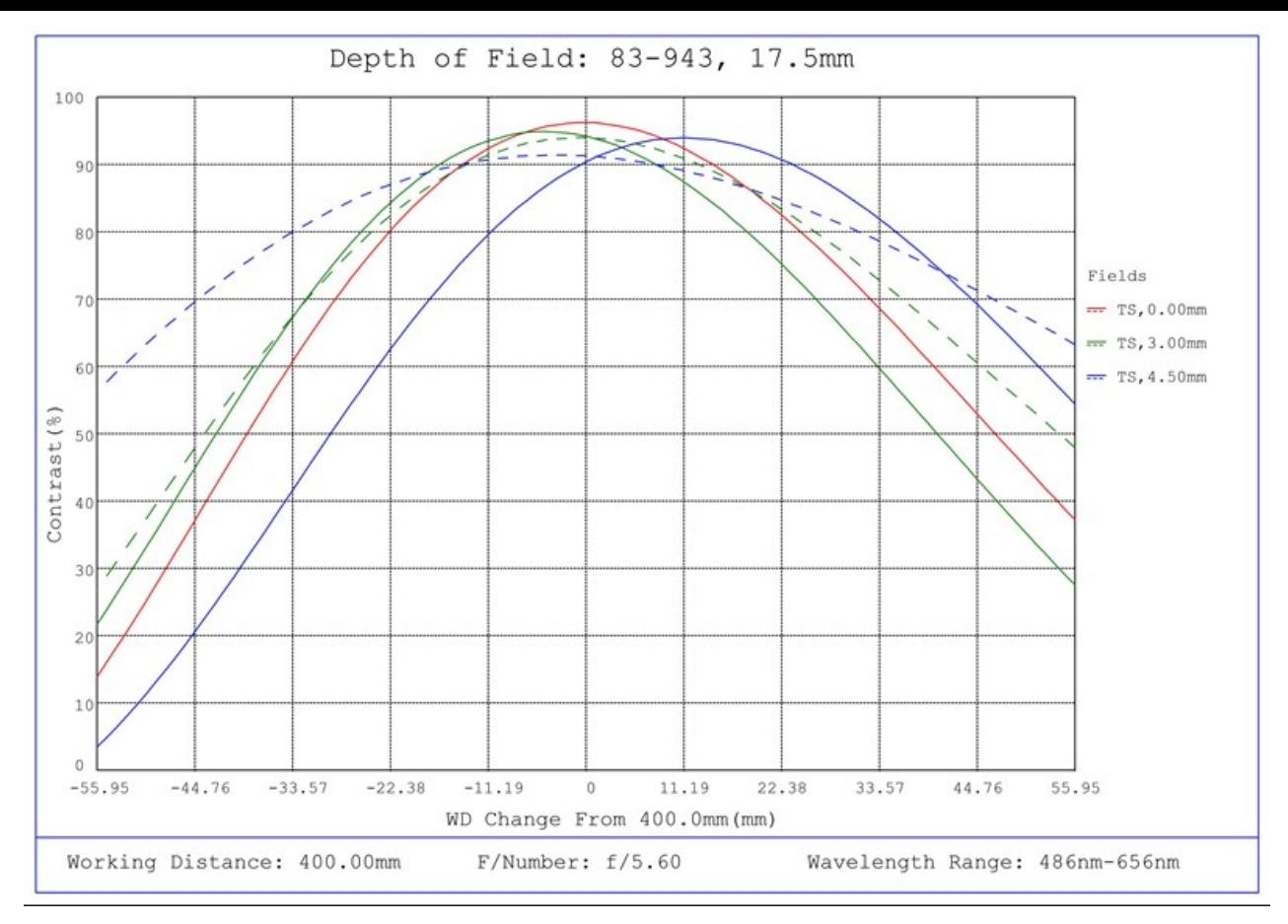
#83-943, 17.5mm FL f/5.6, Blue Series M12 Lens, Depth of Field Plot, 400mm Working Distance, f5.6