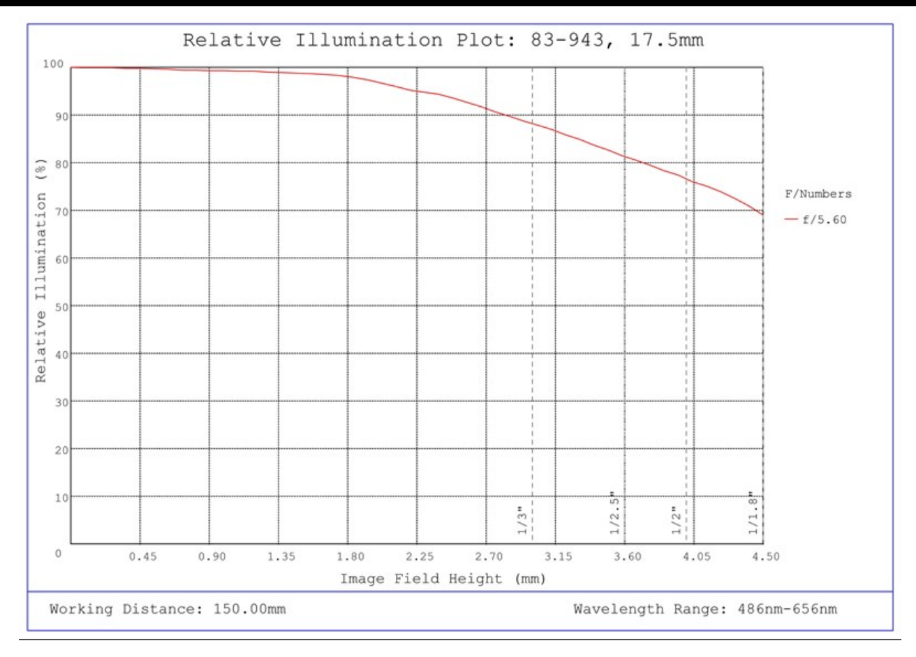
#83-943, 17.5mm FL f/5.6, Blue Series M12 Lens, Relative Illumination Plot