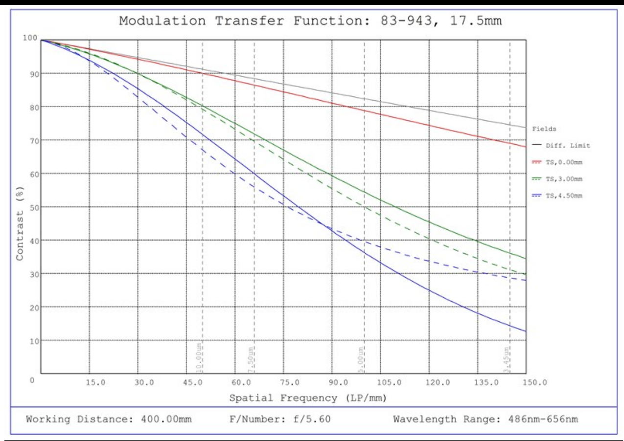
#83-943, 17.5mm FL f/5.6, Blue Series M12 Lens, Modulated Transfer Function (MTF) Plot, 400mm Working Distance, f5.6