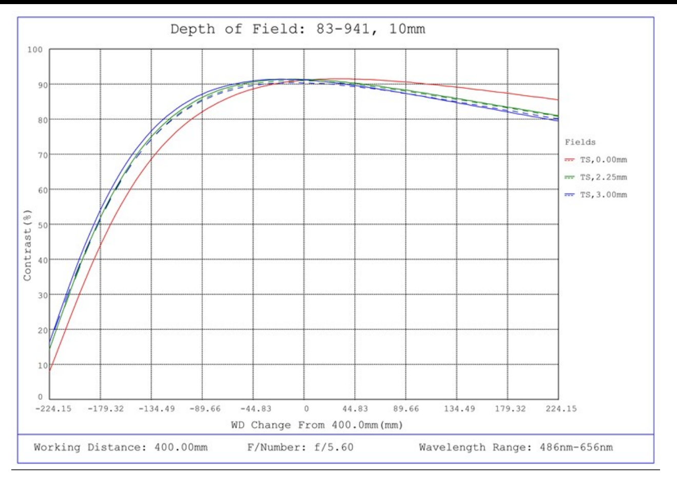
#83-941, 10mm FL f/5.6, Blue Series M12 Lens, Depth of Field Plot, 400mm Working Distance, f5.6