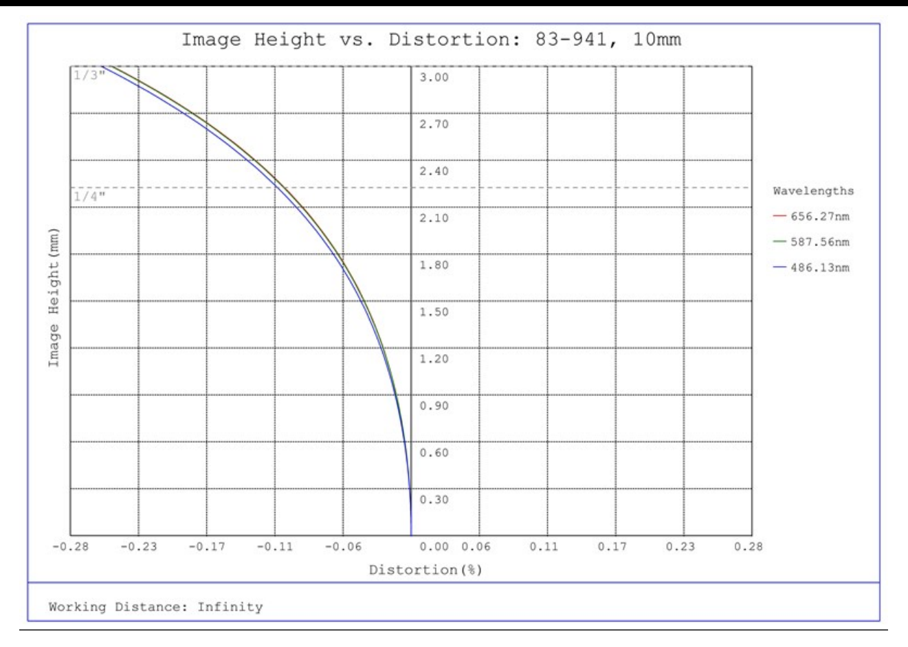
#83-941, 10mm FL f/5.6, Blue Series M12 Lens, Distortion Plot