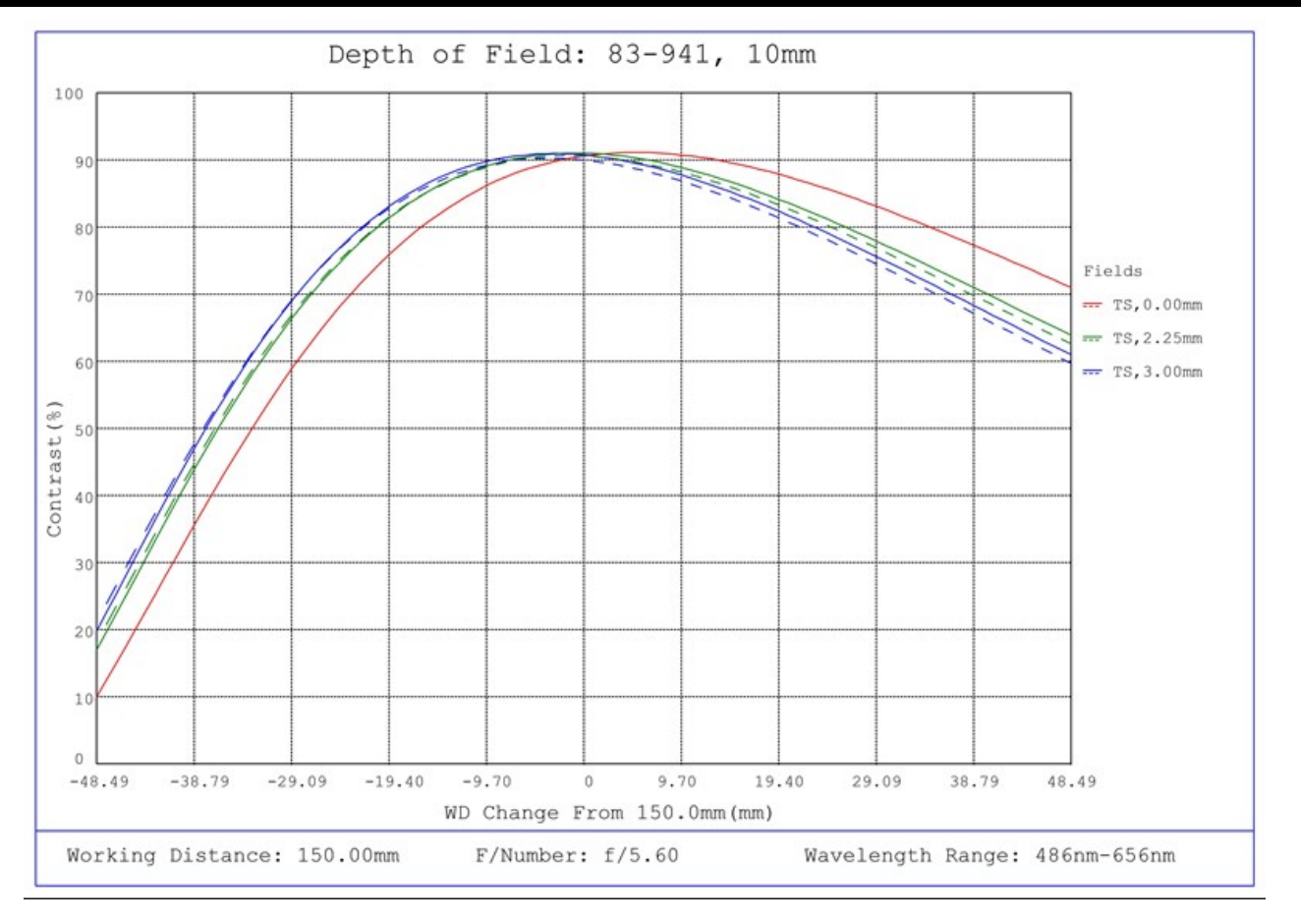
#83-941, 10mm FL f/5.6, Blue Series M12 Lens, Depth of Field Plot, 150mm Working Distance, f5.6