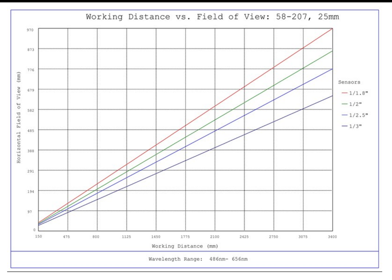
#58-207, 25mm FL f/2.5, Blue Series M12 Lens, Working Distance versus Field of View Plot