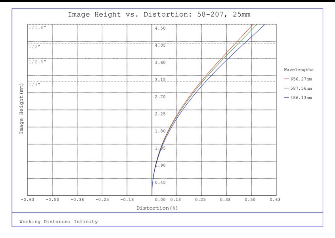
#58-207, 25mm FL f/2.5, Blue Series M12 Lens, Distortion Plot