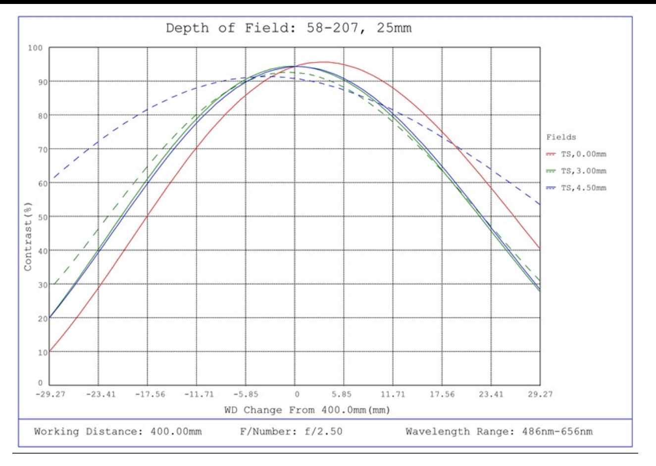
#58-207, 25mm FL f/2.5, Blue Series M12 Lens, Depth of Field Plot, 400mm Working Distance, f2.5