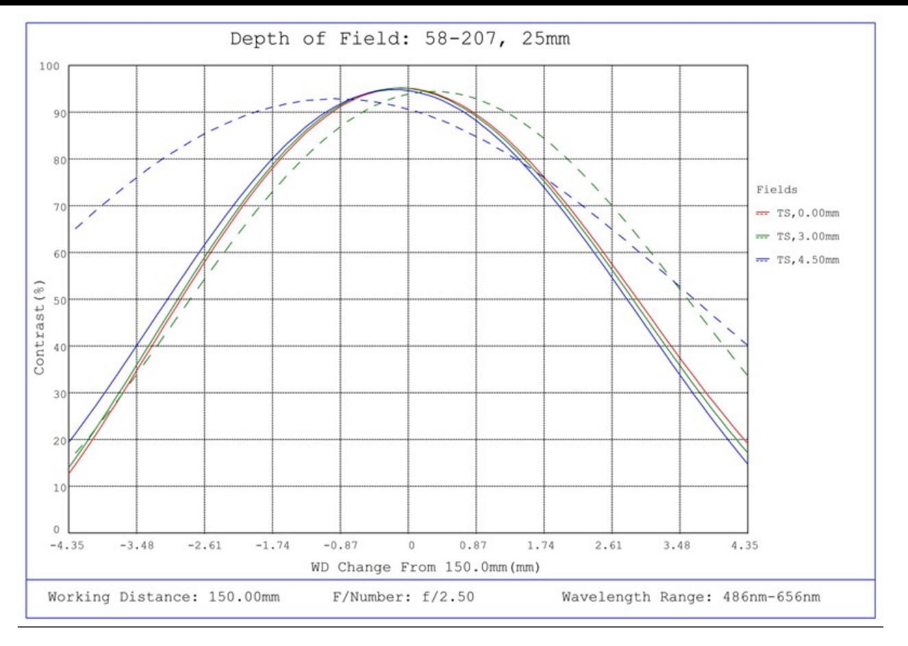
#58-207, 25mm FL f/2.5, Blue Series M12 Lens, Depth of Field Plot, 150mm Working Distance, f2.5