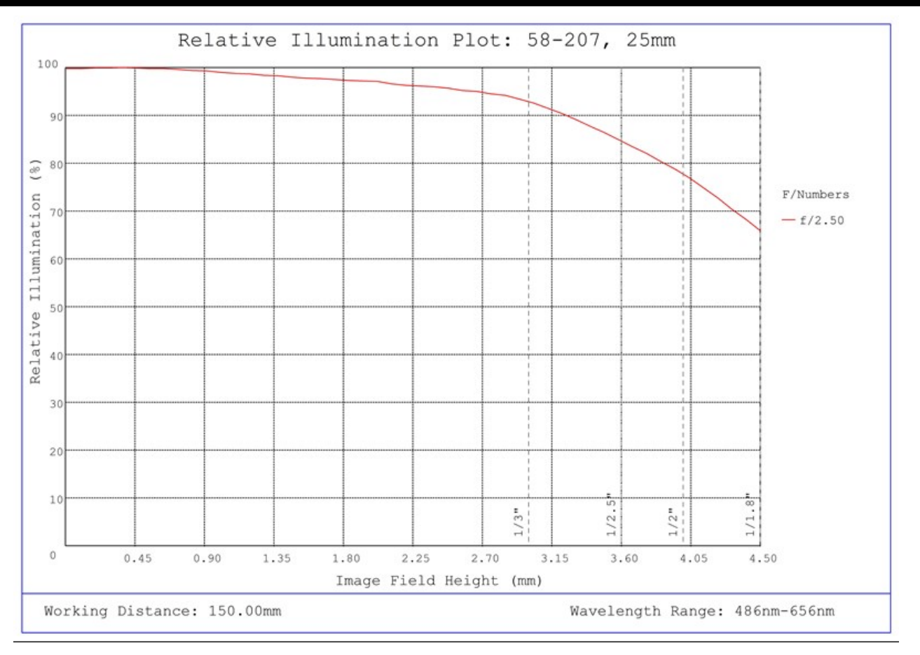
#58-207, 25mm FL f/2.5, Blue Series M12 Lens, Relative Illumination Plot