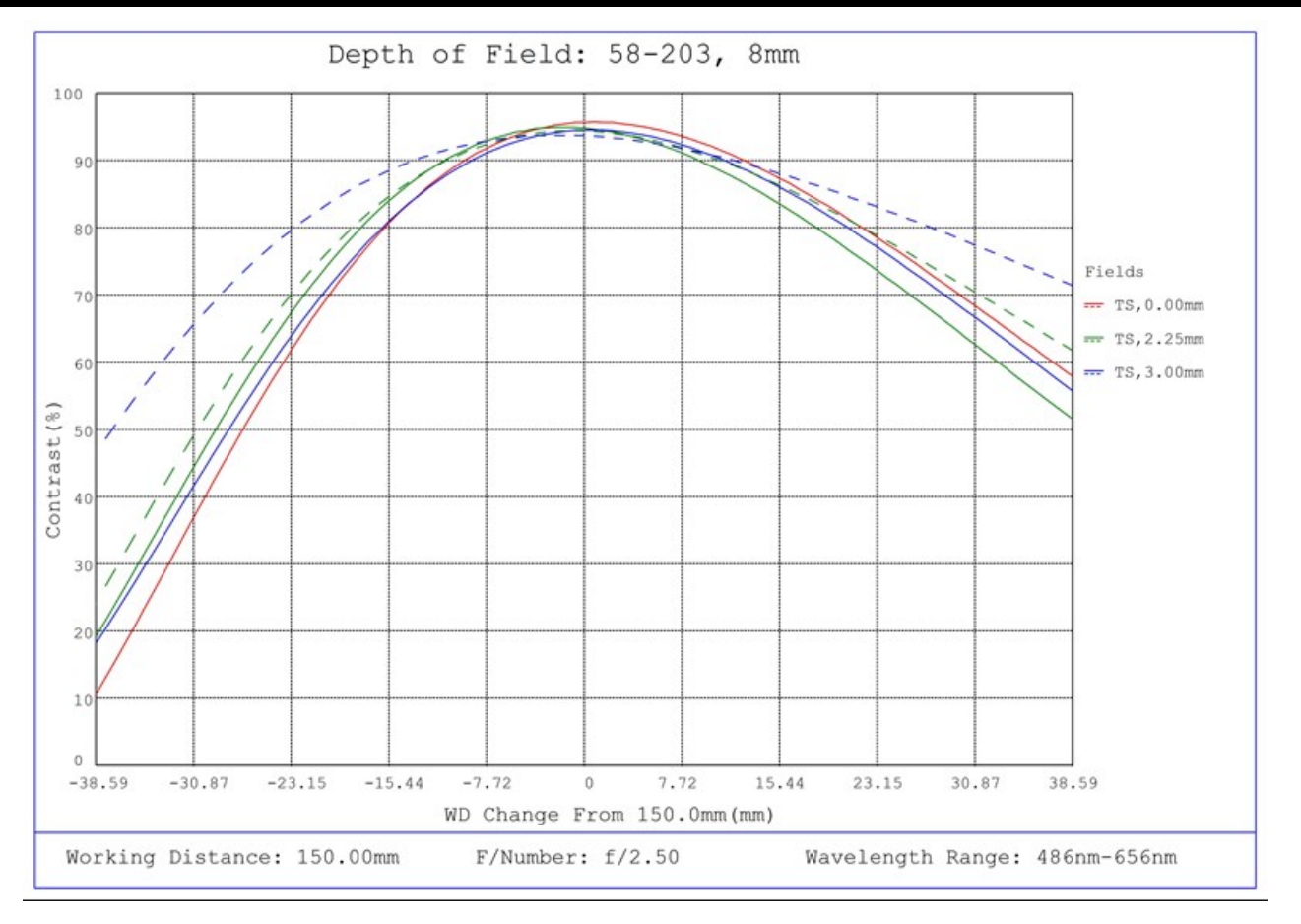
#58-203, 8mm FL f/2.5, Blue Series M12 Lens, Depth of Field Plot, 150mm Working Distance, f2.5