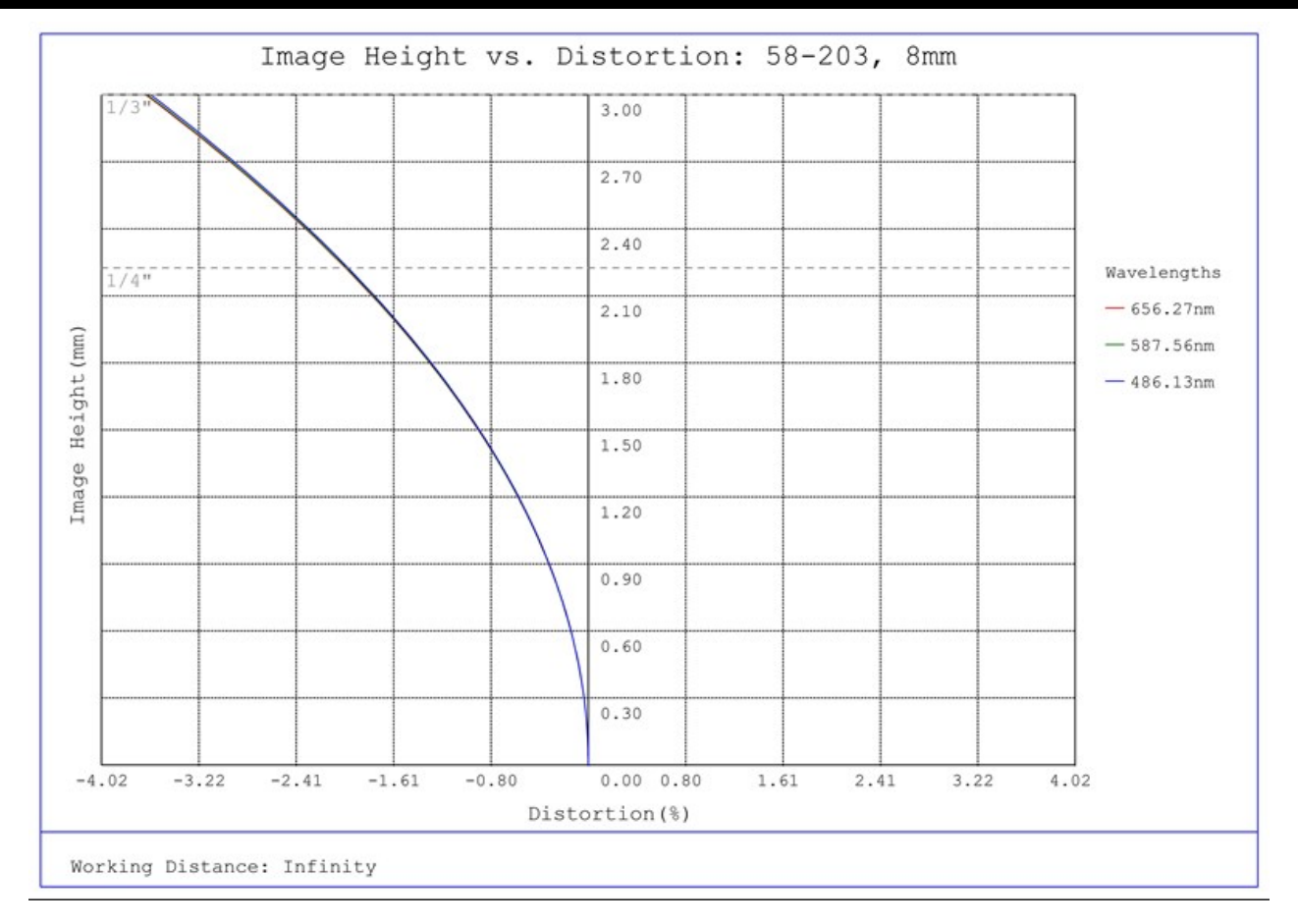
#58-203, 8mm FL f/2.5, Blue Series M12 Lens, Distortion Plot