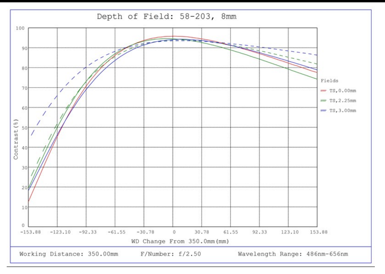
#58-203, 8mm FL f/2.5, Blue Series M12 Lens, Depth of Field Plot, 350mm Working Distance, f2.5