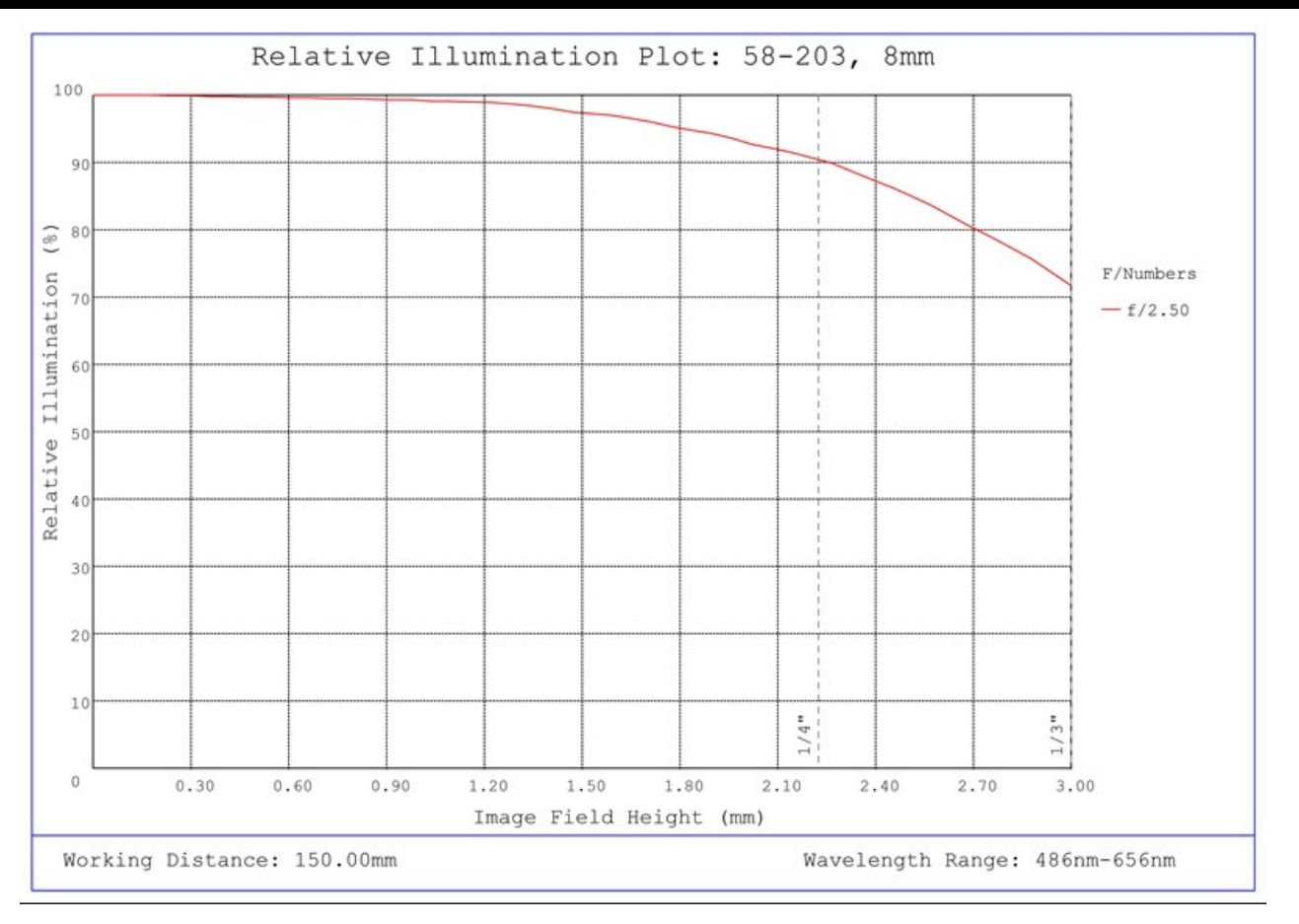
#58-203, 8mm FL f/2.5, Blue Series M12 Lens, Relative Illumination Plot