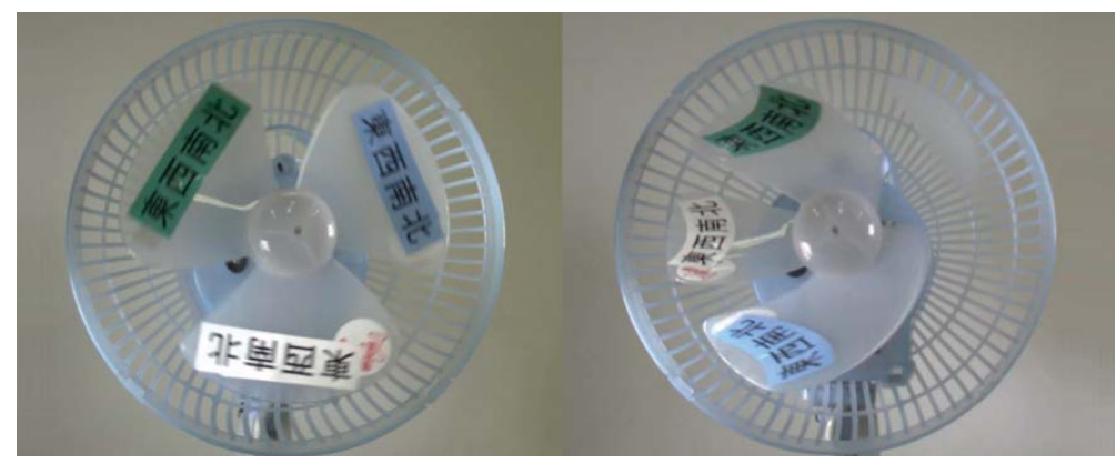
IMX174LQJ (Global Shutter)