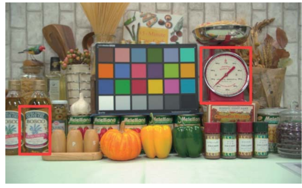
ROI mode (Cropping areas)

Condition: 2000 lx F5.6 (UXGA image ADC 12 bit mode, 60 frame/s, internal gain 0 dB)