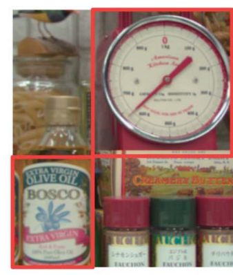
ROI mode (After cropped)