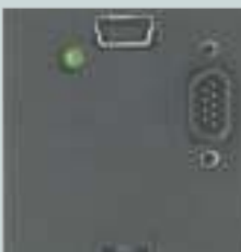
uEye Micro D-SUB connector Description