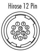
Hirose 12 Pin