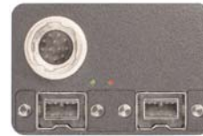
Copper / Daisy Chain