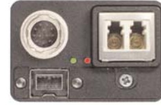
Copper / GOF connections