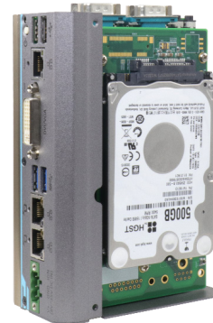
▲ POC-300 with MeziO™ - R11 and 2.5" HDD

** For sub-zero operating temperature, a wide temperature HDD drive or Solid State Disk (SSD) is required.