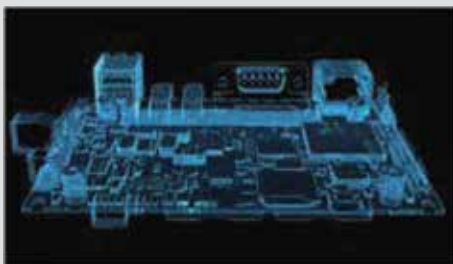
Perfect for embedded systems