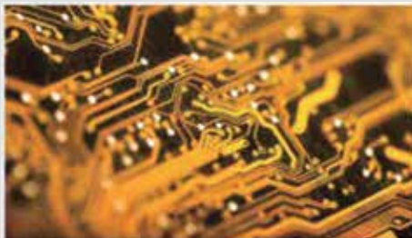
Make precise adjustments to lenses after installation