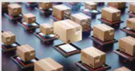
Changing the focus point and changeover for workpieces at different heights