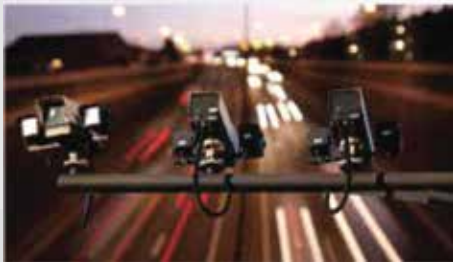
Remotely adjust in out-of-reach places

Motorized FA lens that can be operated easily with a single USB cable