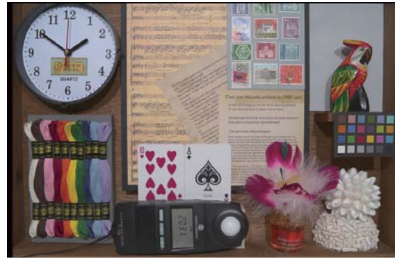
IMX183CQJ-J 33ms accumulation